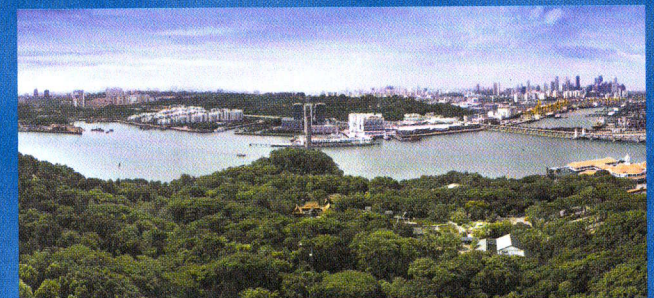
Panoramic views of the Singapore harbour and city skyline

The Tiger Sky Tower on Sentosa. Piercing the sky at an inspiring height of 110 metres, this is one attraction that offers an experience you will never forget. The horizons expand as the air-conditioned cabin heads slowly for the top. When you get there, brace yourself for a breathtaking panoramic view of Singapore, neighbouring Malaysia and the outlying islands of Indonesia.